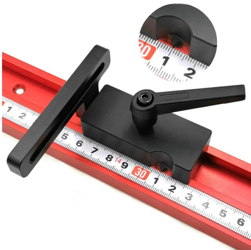
Machinery Measuring Scale