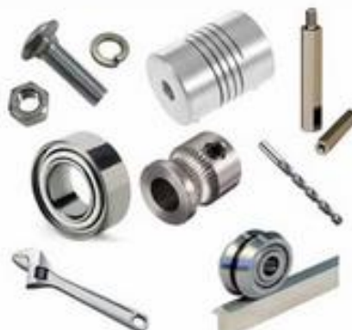
www.handsontec.com Mechanical Hardware